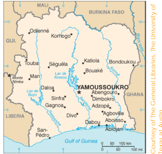
Map of Côte d'Ivoire

The large-scale conversion of forest to cultivated land, a process that commenced at the turn of the 20 th century and continues through to the present, has resulted in a profound fragmentation of Côte d'Ivoire's population of African Elephants. Now believed to occur in some 24 separate locations in the country, the status of the species is poorly known as there has been very little survey work in recent years (Barnes et al. , 1999; Blanc et al. , 2003). According to the most recent estimates using the IUCN African Elephant Database population data categories, Côte d'Ivoire has a very small elephant population, with only 63 in the 'Definite' category, another 360 considered 'Possible' and a further 666 in the 'Speculative' category (Blanc et al. , 2003). Although most elephants occur in protected areas, many small and isolated populations are probably not viable in the long term, particularly if their sex ratios have become skewed from the effects of poaching for ivory (Blanc et al. , 2003). In some locations, crop raiding provokes considerable ongoing human/elephant conflict.