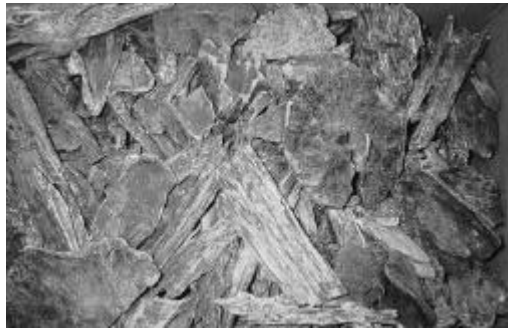
Agarwood chips photographed in Taiwan, January 1999

According to CITES annual report data, Taiwan was an export destination for Aquilaria malaccensis chips, powder and timber for each of the years from 1995 to 1997. Exports to Taiwan totalled approximately 402 t of chips, powder and timber from 1995 to 1997 (211 t in 1995, 70 t in 1996, 121 t in 1997) and one kilogramme of oil in 1995. Of this total, approximately 116 t were exported directly to Taiwan from Indonesia. All but approximately one tonne of the remainder was re-exported to Taiwan from Singapore, and was reported as having originated in Cambodia, Indonesia, Malaysia and Vietnam. Trade in Aquilaria malaccensis has been regulated in Taiwan since 1998 when all CITES Appendix II-listed flora were added to the Notes of the Consolidated List of Commodities Subject to Import and Export Restriction & Commodities Entrusted to Customs for Import and Export Examination (Document No. Trade (87)-07691) (Anon., 1999).