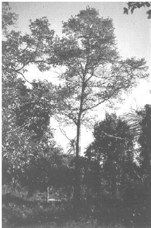
One of the few remaining full-grown Aquilaria trees in southern Vietnam

Unless otherwise referenced, the information below pertaining to Vietnam is based on Heuveling van Beek and Phillips (1999).