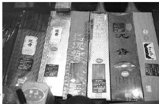
Agarwood incense sticks on display in Taiwan, 1998