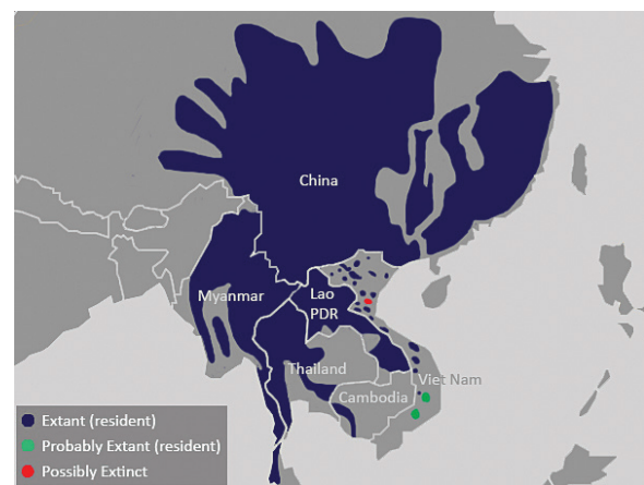
Fig. 1. The distribution of Chinese Serow Capricornis milneedwardsii .

Serows in South-east Asia are threatened by widespread poaching and illegal trade. Almost everywhere they occur, they are reportedly hunted for their meat and their parts which are used in traditional medicines (Duckworth et al. , 2008a; Duckworth et al. , 2008b; Duckworth and Than Zaw, 2008). Serow parts have consistently been observed during surveys of wildlife trade in markets and restaurants undertaken across South-east Asia (see: Martin, 1992; Shepherd, 2001; Shepherd and Krishnasamy, 2014). The same has been observed in Lao PDR where serow parts were commonly found in trade in both rural and urban markets (Duckworth et al. , 1999). Bones, feet, blood, teeth, innards and other body parts are widely used in local traditional medicine production, while the horns are coveted as trophies. There are also records of cross-border trade in serow parts from Lao PDR to China, Thailand and Viet Nam (Duckworth et al. , 1999).