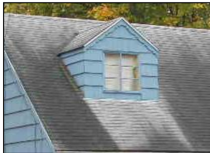
Extensive algae growth

Algae require moisture and proper temperatures to grow. Dew is the primary moisture source. Algae are found predominantly in the Southeast, but it can and will grow nationwide. The algae generally grow on the northern exposures of the roof since this exposure generally receives less sunlight. Algae are well adapted to extreme conditions.