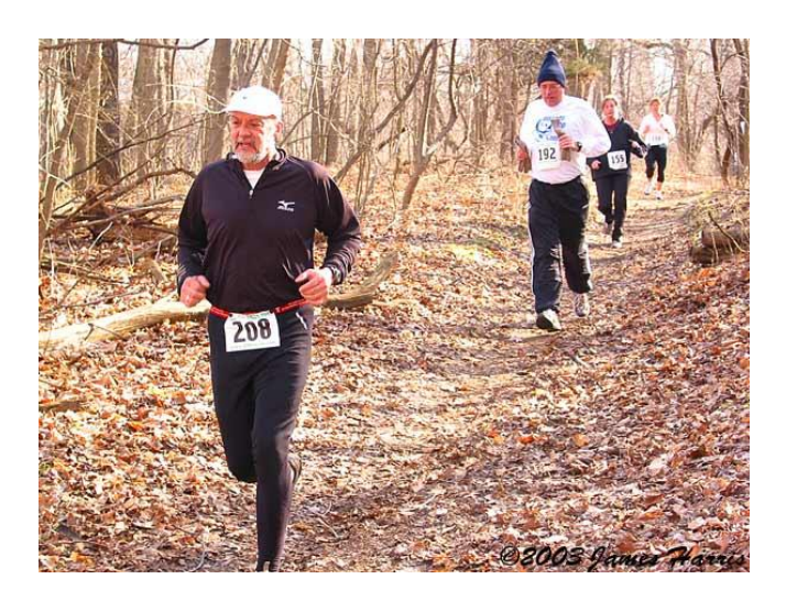
12 Hours of DINO is moved to Winona Lake, Indiana