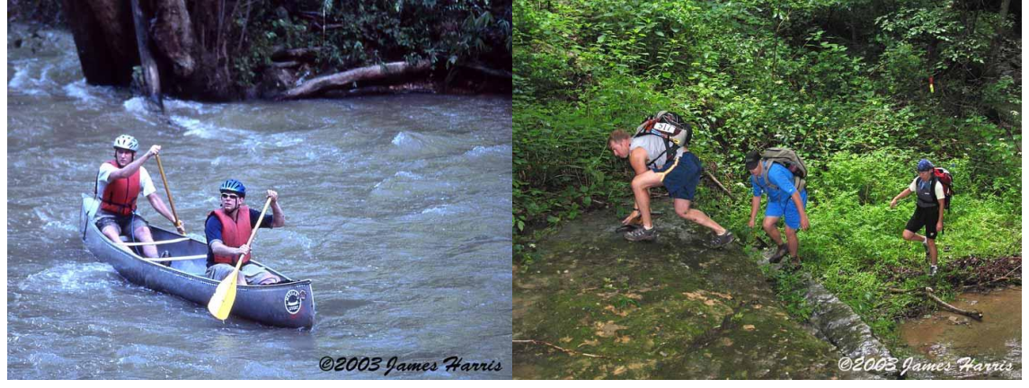
First Tecumseh Trail Marathon held at Yellowwood State Forest. Idea created by Hoosier Hikers Council as a fund-raising, jointly managed event.

First annual MISSION Adventure Race is held at Muscatatuck County Park, North Vernon. Combines cycling, foot travel, canoeing, and rope events as a team event 18 hours long.