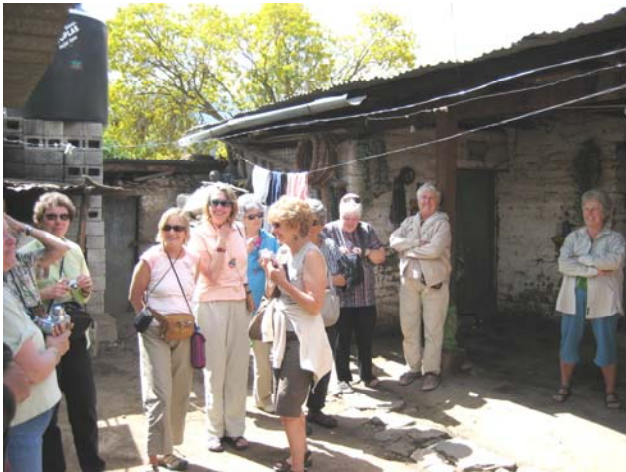
Tourists group at the home of current student in the department of Totonicapán