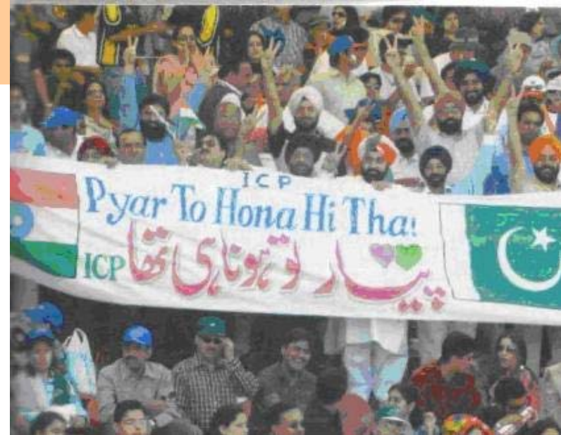
This photograph was taken in Lahore at the India/Pakistan match in 2004. The slogan translates as 'Love is inevitable'.

Reading a joint statement as he stood next to Musharraf, Singh said the two, "conscious of the historic opportunity created by the improved relations and the overwhelming desire of the peoples of the two countries for durable peace...determined that the peace process was now irreversible".