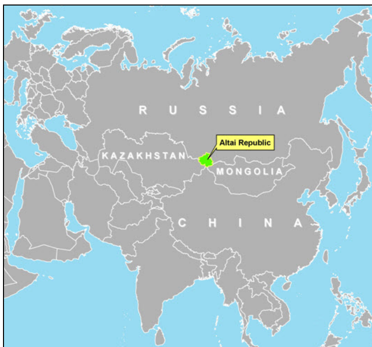
Map One: Location of the Altai-Sayan Ecoregion and Altai Republic, Russia

They are located in the “heart of Asia”, and form the headwaters of many rivers including two of the 10 largest rivers of the world, the mighty Russian Ob and Irtysh Rivers which flow from the Altai Mountains (southern Siberia) to the Arctic Ocean. The spectacular mountain landscapes include high mountain peaks including Mount Belukha, the highest mountain in Siberia (4506 metres) with its 169 glaciers that extend over 280 square kilometres, glacial lakes, and deep glacial carved valleys and the headwaters of the river Katun, a tributary of the Ob River (Yashina 2008). The Altai-Sayan area is recognised as one of WWF’s critical Global 200 Ecoregions (WWF 2009a). An Ecoregion is defined as a large area of land or water that contains a geographically distinct assemblage of natural communities that (a) share a large majority of their species and ecological dynamics;(b) share similar environmental conditions, and;(c) interact ecologically in ways that are critical for their long-term persistence (WWF 2009b). WWF states for the Altai-Sayan that: