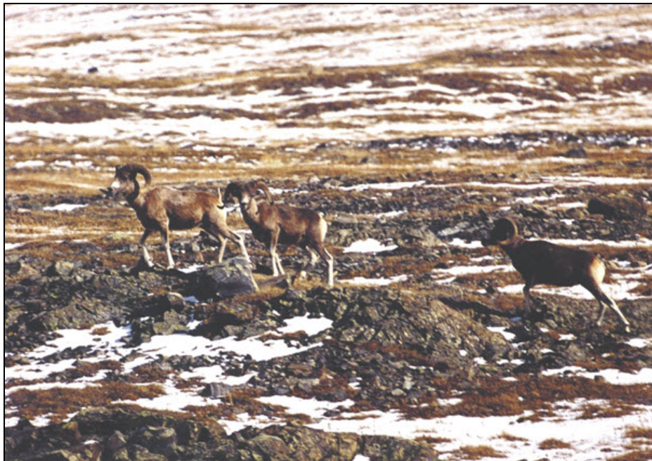
The Argali ( Ovis ammon ), Altai-Sayan Mountains

There are many threats to the natural heritage of the Ecoregion, including poaching and illegal trading in flora and fauna, infrastructure development, habitat destruction and deforestation, pollution and the threat of climate change. Climate change is a major issue. Records maintained by the Russian Hydro-meteorological Service report identify an increase in average temperatures since 1970 of 1.5 C consistent with global warming and glacial reduction is clearly evident in the