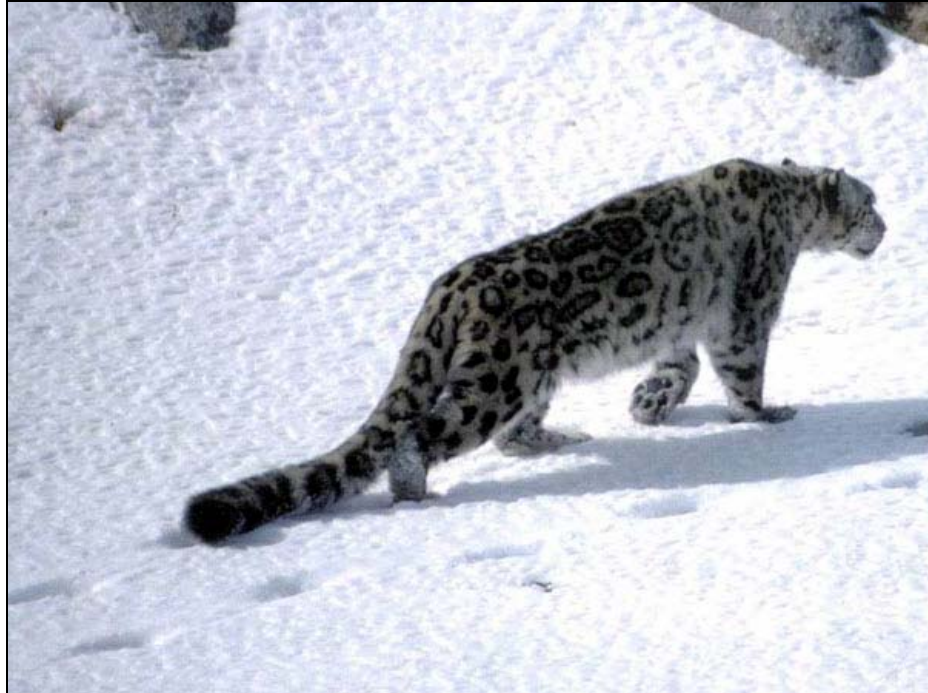
The snow leopard ( Uncia uncia ), Altai-Sayan Mountains