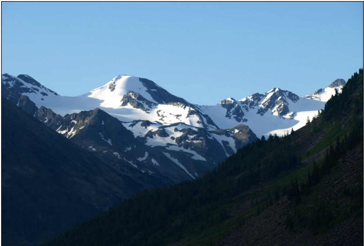
Katunskiy Biosphere Reserve and World Heritage Site, Altai Mountains, Russia [Graeme Worboys]