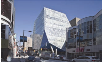
Ryerson Student Learning Centre , designed by Snøhetta and Zeidler Partnership Architects