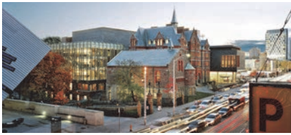
Telus Centre for Performance and Learning at the Royal Conservatory of Music , designed by Kuwabara Payne McKenna Blumberg (KPMB)