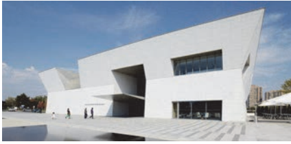
Aga Khan Museum , designed by Fumihiko Maki, Hon. FAIA, and Moriyama & Teshima