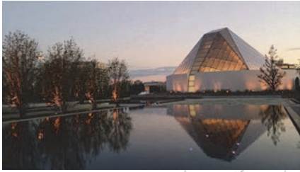
Ismaili Centre , designed by RIBA Gold Medalist Charles Correa and Moriyama & Teshima