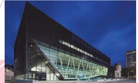
Goldring Centre for High Performance Sport , designed by Patkau Architects and MJMA