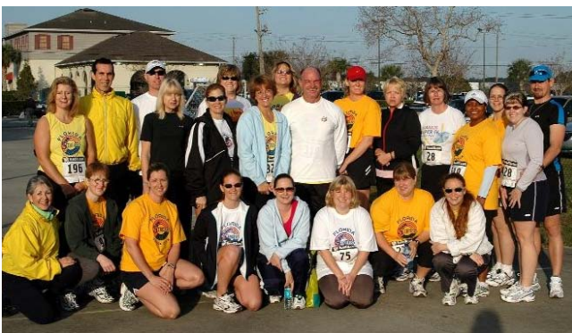
The Florida Striders New Runner class at Matanzas 5000 on January 28th