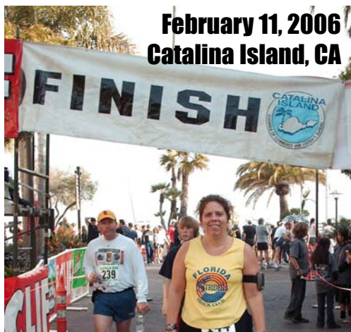
The Buffalo Run Half-Marathon

The Road Runners Club of America is a non-profit organization of over 700 running clubs and 175,000 members across the United States. The RRCA chapters organize races, have training runs, provide safety guidelines, promote children's and masters fitness running programs, and have social programs. http://www.RRCA.org