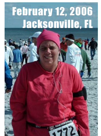
Winter Beach Run

I left the hotel at 4:30 AM in Long Beach, California and headed to catch the 6:15 AM "fast" boat to Catalina Island. The brochure stated it was a very challenging course and it didn't disappoint me. It started at sea level and went to 1634 feet, which was at 9 miles and then came down! To make a long story short, I finished in time to take the 2:00 PM boat back to Long Beach, catch a 9:55 PM flight back to Jacksonville, drive to St. Augustine, get warm clothes, and head back Jax Beach to run the Winter Beach Run. But I lost ambition and only ran the 5-Mile race. Next adventure is the LA Marathon on March 19th! Stay tuned!