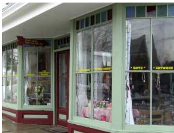
Philmont Trader storefront