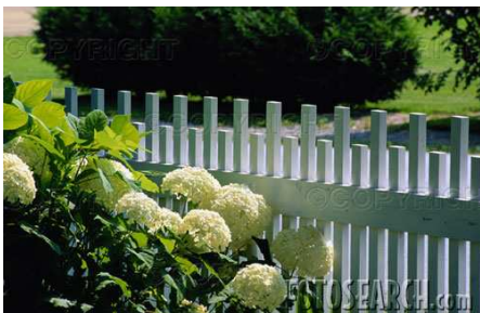
Suggestion of possible fencing style