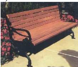
Bench in Little Park