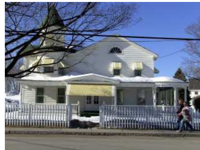
Existing use of picket fence in target area / residential