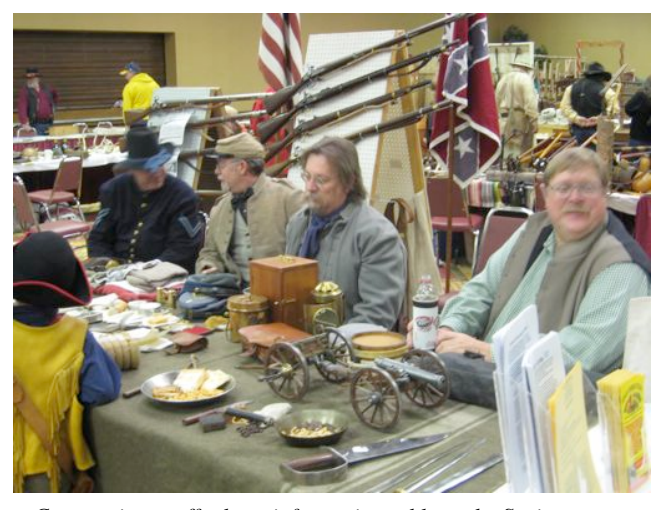
Compatriots staff a busy information table at the Spring Muzzleloaders' convention, giving accurate historical perspective to the War Between the States.

Let's give our uneducated opponents that good fight! Your obedient servant and humble but lovable Adjutant, Bob