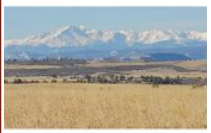
Trees on the nearby hills mark the Black Forest, and the approximate site of Russellville.

A 33-acre private ranch just southeast of Franktown - known as the Russellville Ranch - is the earliest settlement in Douglas County, and has several ties to Confederate history as well as "Pike's Peak or Bust" gold rush tales.