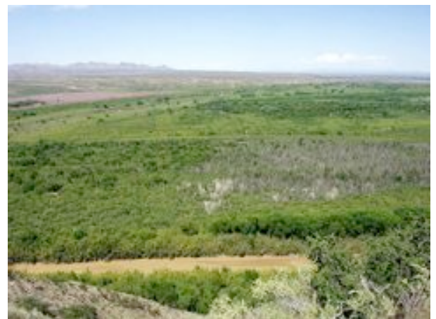
The Valverde Battlefield site, today, near Socorro, NM. Sitting along the Valverde river near the Rio Grande, the site is now silted over, but still accessible to visitors.