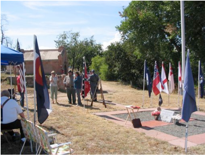
Photo Album, Riverside Cemetery Ceremonies, United Daughters of the Confederacy