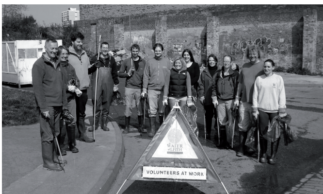
Scottish Government Team at Bonnington

and of course our stalwart band of cleaner-upers.