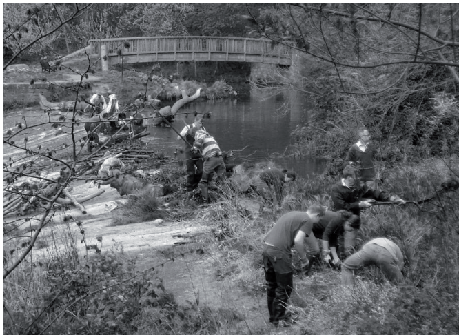
The Bells Mill Blitz – included the very smelly lade clearing.

Once again we have so many people to thank for keeping the Water of Leith clean, green and beautiful. Since April there have been 24 workdays with volunteers, community groups and local businesses on the river, amounting to some 1400 hours of effort. The following groups have all taken part in activities since April: