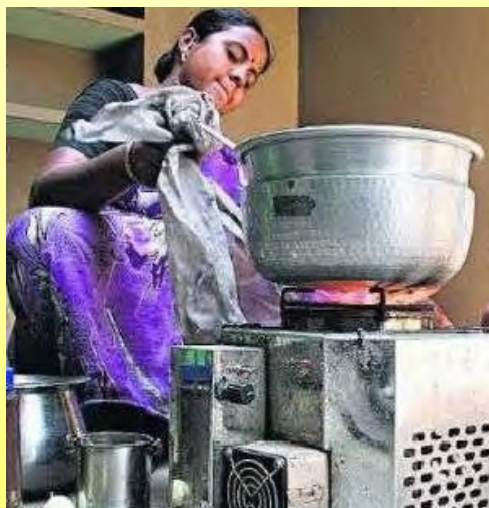
BP Oorja Stove: Smokeless Biomass Stove

Surya's study methodology is unique because it aims to collect high quality, reliable data at every level: from the individual household, to the village, to the regional impacts of the project intervention. Household data will be collected via cutting-edge sensor technologies and analytics installed in mobile phones distributed to participating households. These mobile phones will measure individual reductions in exposure to pollutants as well as adherence to the intervention in a distributed and scalable fashion that improves on traditional data collection technologies. Instrumented towers installed in each region will collect climate-related metrics at the village level including concentrations of BC, carbon monoxide, and ozone, and will measure the resulting change in the solar heating of the air and the ground. Finally, these data will be combined with the most advanced data from A-Train NASA satellite ( http://aura.gsfc.nasa.gov/instruments/omi.html ) to measure the regional heating effects and probable cooling effect of other particles emitted when solid biofuels are burned.