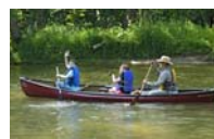
Discover the Wildcat