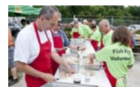
Sheriff's Fish Fry