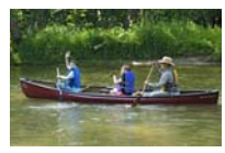
Discover the Wildcat