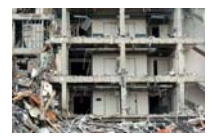
Home Hospital Demolition

Live Near Purdue www.Campus-Suites.com Lease today and receive $150. Campus Suites. Visit Us Today.