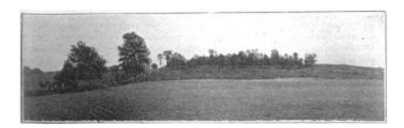
COOK'S MOUND, Two MILKS SOUTHEAST OF NEW RICHMOND, MONTGOMERY COUNTY, INDIANA.

The converged lobes before mentioned moved down to the Shelbyville moraine extending from northern Vigo County northeast through Parke, east through Putnam and thence southeast. This moraine extends as a continuous plain, trenched by streams, bearing on its surface the weak dome-shaped swells that mark it as morainic in character to the northern part of Montgomery County, extending northwestward to and across the Wabash, which was one of its great terminal drainage lines, into which flowed Raccoon and Sugar creeks, mighty streams from the ice border further east. As the ice retreated to the present divide between Sugar and Coal creeks, the slope descending to the north was gradually uncovered, and a lake began to form along the southern border of the glacier, which overflowed south across the divide by Potato, Lye and Black creeks