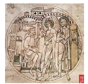
The Life of Guthlac drawing, kept at The British Library

Britain does not have natural deserts, so Guthlac preferred to live as a hermit, surrounded by dangerous and impassable bogs from all sides.