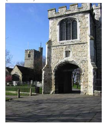
St Margaret's Church

the great convent in Wimborne in Dorset. In the 10th century, at the time of the monastic revival in England, Barking had another saintly abbess named Wulfhild (+ 1000).