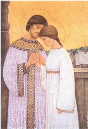
Sts Peter and Fevronia (Patrons of Christian marriage) by A. Prostev

To avoid sexual sins, the best remedy is to suppress sinful thoughts and desires at their root, not giving them an opportunity to strengthen and take control over our will. Knowing how difficult it is for us to do battle with carnal temptations, the Lord instructs us to be resolute and unmerciful towards ourselves when confronted by temptations: “If your right eye causes you to sin, pluck it out and cast it from you; for it is more profitable for you that one of your members perish, than for your whole body to be cast into hell” (Matthew 5:29). This figurative speech can be rephrased as follows: If someone is as dear to you as your own eye or hand, but tempts you to sin, quickly break off all relations with him or her. For it is better for you to deprive yourself of his or her friendship than of everlasting life.