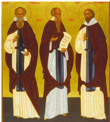
Icon of Sts Comgall, Gallen and Columban