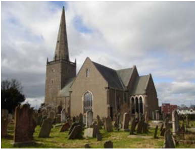
Bangor Abbey, North Down

and on the basis of these hymns and psalms “The Antiphony of Bangor” was compiled, a copy of which has survived to this day.