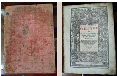
First Altar Gospel of the Russian Embassy Church in London

the English, and ‘treat visiting Greeks with proper indulgence and kindness’.