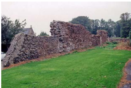
Bangor Abbey wall - the only remaining evidence of the early Medieval monastery at Bangor

unique map, one of the earliest medieval maps of the world, is kept at Hereford Cathedral in England as a precious relic to this day.