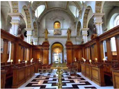
Inside St Bride's Church

ered, along with interesting artifacts and the remains of a Roman construction. Up to the end of the twentieth century the offices of numerous English newspapers and agencies were concentrated close to St Bride's. By now they have all moved to other districts, but the church remains a 'protector' of the publishing industry. One of the church side-chapels is dedicated to the memory of journalists and reporters who were killed during the two World Wars, with photographs of many of them placed in it. The church interior is richly decorated with oak and is an excellent example of Baroque. There is a museum in the crypt, devoted to the church's history over the centuries. A bust of Virginia Dare, the first English child born in North America, can be seen above the font (her parents had married at St Bride's in the 1580s).