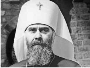
Metropolitan Anthony of Sourozh

For many years the Easter Midnight Service of our Cathedral was broadcast to the Soviet Union by the BBC. Metropolitan Anthony's sermon at this service in 1985, stressing the material reality of the Resurrection of Christ which some are prepared to question, was published in English in the Cathedral Newsletter, number 176 (June 1985).