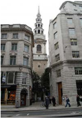
St Bride's Church in Fleet Street, London

This charming ancient church stands in Fleet Street, in the City of London. The street derives its name from the River Fleet, which once ran here but now it exists as an underground sewer. The first church on this site was built in the sixth century. According to one version, it was built by St Brigid of Kildare, the patroness of Ireland, during her travels across Britain, or, according to another version, by Irish missionary monks. Throughout its history the church was rebuilt and extended six to seven times. St Bride's is famous all over the world as a symbol and spiritual centre for journalists, publishers and media workers. Prayer for those engaged in these occupations (living, as well as departed) has been going on continuously here for 500 years, and many of them still attend this church for worship.