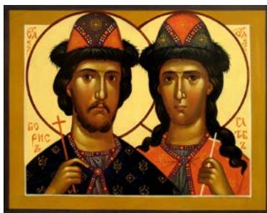
Saints Boris and Gleb

Throughout the project, there will be expositions of children's art, thematic discussions, and even a musical. This will be open to all, to encourage people to learn about Russia's spiritual and cultural heritage, and to participate in the festive events we shall be holding to celebrate this date.