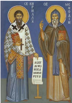
Saints Cyril and Methodius, Apostles to the Slavs

Saints Cyril and Methodius, Apostles to the Slavs, came from a prominent and pious family in Thessalonica. St Methodius was the eldest of seven brothers; St Constantine the youngest [Cyril was Constantine’s monastic name]. St Methodius was a man of action, spending his early years in the military and later serving as Governor of one of the Slavic principalities dependent on the Byzantine Empire, most likely Bulgaria. It was here that he learned Slavonic. After ten years in Bulgaria, St Methodius received monastic tonsure and retired to a monastery on Mount Olympus in Asia Minor.