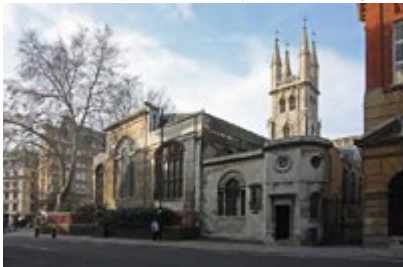
Church of Holy Sepulchre-without-Newgate, Holborn

This ancient splendid church stands in Holborn Viaduct within the City of London, approximately in front of the Old Bailey, the Central Criminal Court in London. Formerly it stood just beyond ("without") an old city wall close to