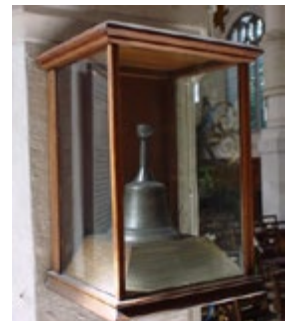
The Execution Bell

St Sepulchre's is the main church for musicians in Britain. The names of great composers are connected with it. The north aisle houses "the musicians' chapel" where the composer John Ireland (1879-1962), the conductor and initiator of the famous "promenade concerts" Henry Wood (1869-1944; buried in the chapel), and the Australian-born singer Nellie Melba (1861-1931) are commemorated in stained glass. There is also the musicians' Book of Remembrance.