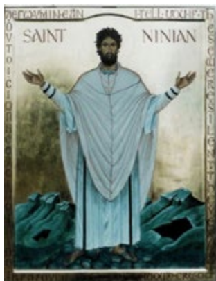
St Ninian of Whithorn

Hadrian's Wall in northern England. His father was a local Christian ruler. While still very young, St Ninian began to feel a calling to Christianise his native country. The saint went to study in Rome and then visited Gaul where at the monastery in Tours he met St Martin—a great missionary and father of monasticism in Gaul. Ninian was consecrated bishop either in Rome or Gaul (if the latter, the consecration was performed by Martin himself).