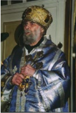
Metropolitan Anthony of Sourozh

In the Name of the Father, the Son and the Holy Ghost.