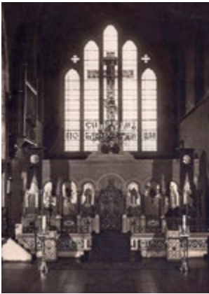
The interior of St Philip's Church, Buckingham Palace Road.

Between 1921 and 1956 - the church of the Russian parish (after 1926, parishes of the Dormition of the Mother of God.