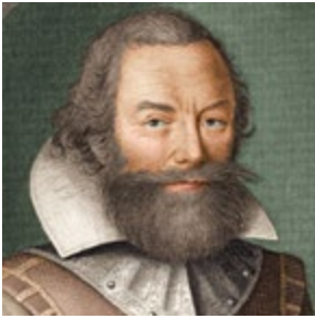
Captain John Smith

The church has close military links: the south aisle has “a regimental chapel of the Royal Fusiliers”, and next to the church there is a memorial garden to the Royal Regiment of Fusiliers. Royal riflemen hold an annual services at the chapel, and at its west end the riflemen who fell in the two World Wars are commemorated in remembrance books.