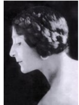
Princess Katherine Yourievsky