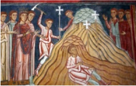
The holy Empress Helen discovering the Life-Giving Cross. Capella San Silvestro (XIII century) in the complex of Santi Quattro Coronati in Rome, Italy

Finally, they directed her to a certain elderly Hebrew by the name of Jude who stated that the Cross was buried where the temple of Venus stood. They demolished the pagan temple and, after praying, they began to excavate the ground. Soon the Tomb of the Lord was uncovered. Not far from it were three crosses, a board with the inscription ordered by Pilate, and four nails which had pierced the Lord's Body (March 6).