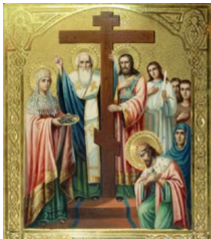
Icon of the Universal Exaltation of the Precious and Life-Giving Cross

The Elevation of the Venerable and Life-Creating Cross of the Lord: The pagan Roman emperors tried to completely eradicate from human memory the holy places where our Lord Jesus Christ suffered and was resurrected for mankind. The Emperor Hadrian (117-138) gave orders to cover over the ground of Golgotha and the Sepulchre of the Lord, and to build a temple of the pagan goddess Venus and a statue of Jupiter.