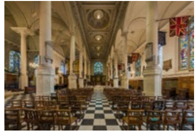
The interior of St Sepulchre

largest parish church of the City. In the fifteenth century it was rebuilt but after the fire of 1666 only the outer walls and a tower (150 feet high) remained. The church was quickly rebuilt by its faithful parishioners and in the 1870s it was restored again. The church miraculously remained practically intact during the Second World War – only a watch-house (used for deterring robbers) was destroyed.