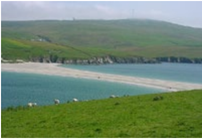
St Ninian's Isle

and calling everybody to his deathbed. Ninian was buried in a stone coffin near the altar of the church that he had built on Whithorn. Pilgrims flocked to his relics up to the Reformation in the sixteenth century. The Whithorn monastery had close connections with Mediterranean countries. Its monks were famous for their learning and severity of ascetic life, adopted by them from the Christian East. Many future missionaries, now venerated in different parts of Scotland, studied in Whithorn. The cave where Ninian used to pray and the saint's personal bell have survived. The cave is located on the east side of the peninsula. It is a peaceful, quiet place in idyllic surroundings, and all Christians who visit it feel the holy bishop's presence there to this day. An ancient settlement, now a district within the city of Stirling, is called St Ninians in honour of the saint.