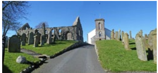
Ruins of the Whithorn Priory on the Whithorn peninsula

Excavations carried out on Whithorn in recent times have confirmed the authenticity of the ancient traditions concerning Ninian. The remains of a very ancient circular church were discovered, and its walls had indeed been whitewashed! Ancient inscribed Christian gravestones as well as very small wattle houses were discovered near the church, which indicates that a monastic community had existed here in the Celtic period. The monastery had more than one church and it definitely had a school. It is believed that the monastery kept a portion of St Martin's relics as well as those of other saints.