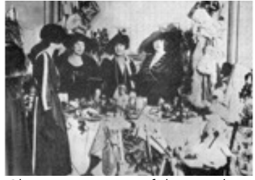
Christmas Bazaar of the London Russian parish (1920s)