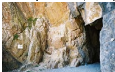
St Ninian's original cave

According to a legend, at the moment of Ninian's repose, a bell began to ring by itself, announcing the death of the righteous man