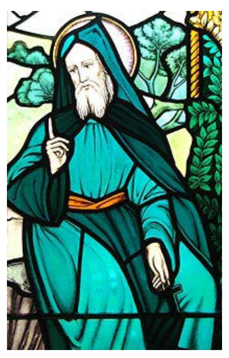
A stained glass image of St Beuno

with stubborn sinners but was full of mercy and compassion for penitents and those who suffered. Towards the end of his life, Beuno was rewarded by the Lord with the gift of discernment and was able to penetrate into the depths and mysteries of the spiritual world. Throughout his life, Beuno worked numerous miracles of healing. He was also a very active and successful missionary, his preaching of the Word of God reached many corners of Wales and south-west England. Among the contemporary theologians Beuno was famous for his knowledge