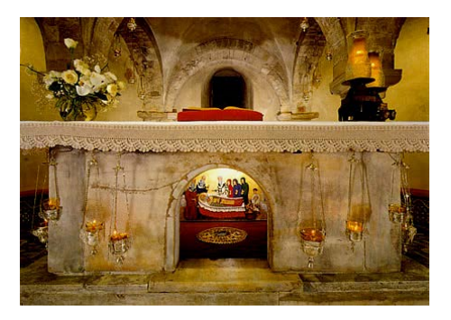
St. Nicholas' Tomb in the crypt, Basilica San Nicola di Bari