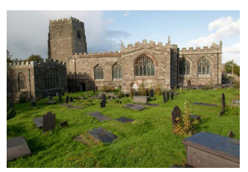
St Beuno's Church in Clynnog Fawr, Gwynedd

Many churches are dedicated to this saint. This demonstrates that Beuno and his disciples built a large number of churches and monasteries in various districts of Wales and in the border areas of England. The majority of these churches can be found in northern and northwestern Wales, including the Isle of Anglesey and in the Lleyn Peninsula. Churches dedicated to the holy man can also be found in central,