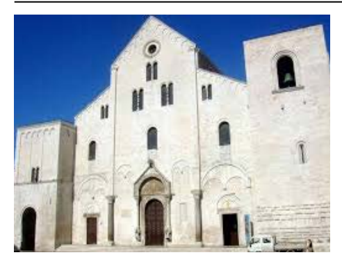
Basilica of St Nicholas of Myra in Bari