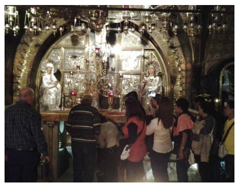
Inside the Church of the Holy Sepulchre (Photograph - John Newbery )

The Church of the Holy Sepulchre is entered from a large courtyard and the first place seen is the Stone of Unction, covered by a marble slab, where Christ's body was laid after the Crucifixion, anointed, and wrapped for burial. Nearby, two staircases lead up to the site of the Crucifixion, Golgotha, 'the