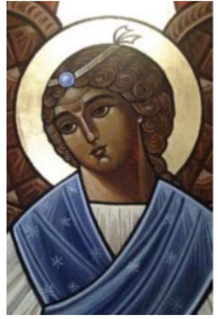
Archangel's face. Detail from Three Youths in the Fiery Furnace. 2014

I was made a honorary patron of the British Association of