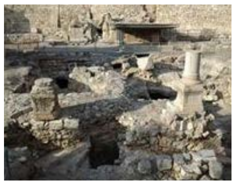
The Pool of Bethesda (Photograph - John Newbery )