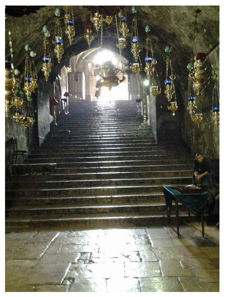
Steps leading into the Church of the Tomb of the Mother of God