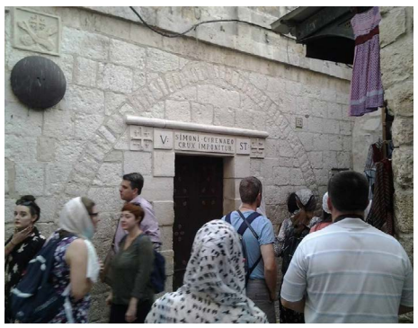
On the Via Dolorosa