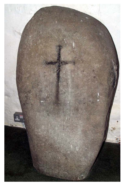
The St Beuno's Stone at Clynnog Fawr -7th-9th Century

area of rare beauty. The cliffs near the village reach 1,200 feet; a spring flows down the cliff to the ocean forming a picturesque cascade. Culbone church is 35 feet long and 12 feet wide, and seats 16 people. This moving church consists of a sanctuary, a nave, and a porch, and has a small spire. Its present fabric dates from the twelfth-thirteenth centuries. Despite the fact that this place is difficult to access and there is no road nearby, services are celebrated in it regularly. Some of St Beuno's relics may rest under this church.