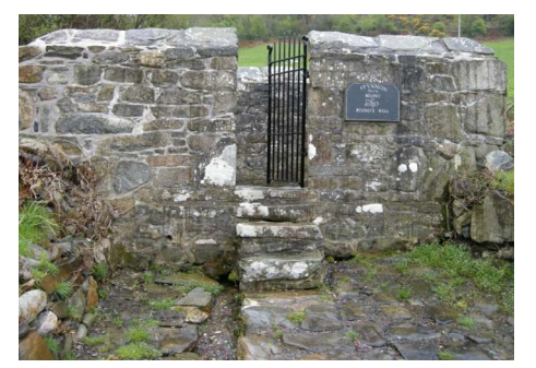
St Beuno's Holy Well in Clynnog Fawr, Gwynedd

Until the early 19th century there was a custom among farmers in the vicinity of Clynnog Fawr to make donations to St Beuno's Church in the form of