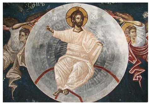
A painting of the Ascension at the Ubisi Monastery in Georgia

human nature, the flesh received from the Virgin, the material of the created world, with Him into the Mystery of the Trinity.