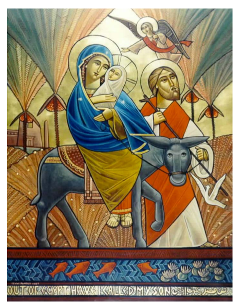
Flight into Egypt by Dr Isaac Fanous Source - copticiconography.org

People usually contact us with requests for exhibitions. We generally choose around twenty percent of applicants based on the work they submit, which we consider in line with our ethos. The Sisters of St Elisabeth's Convent fulfilled our