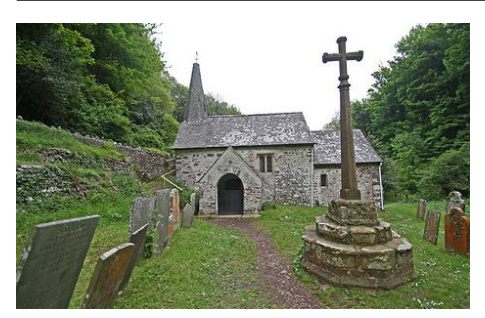
St Beuno's Church in Culbone, Somerset (the smallest parish church in all England)