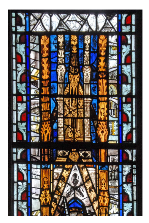
Medieval stained glass of St Ethelbert at Hereford Cathedral, Herefordshire