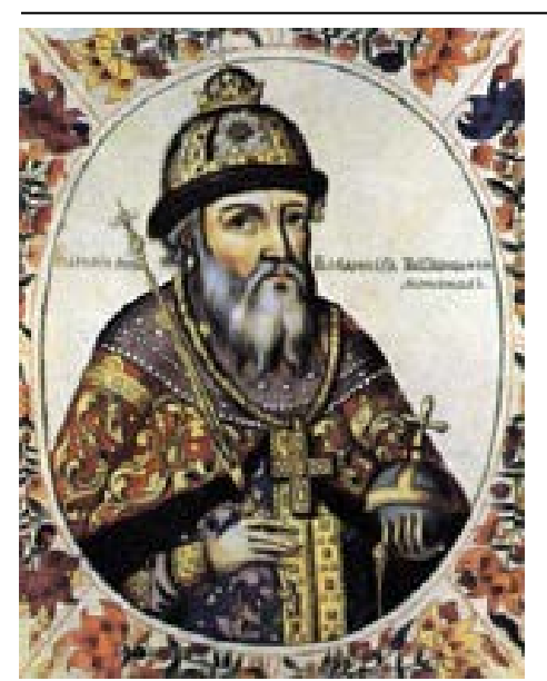
Vladimir Momomakh

sent with the aim of bringing Russia under the spiritual authority of Rome."