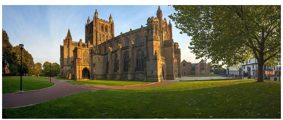
Hereford Cathedral