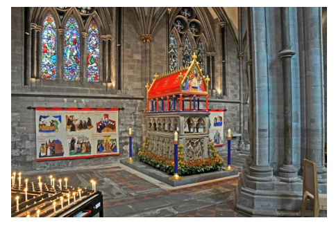
Bishop Thomas Cantilupe's shrine inside Hereford Cathedral, Herefordshire

of pilgrims. The cathedral consists of the chancel, the nave, the choir, numerous transepts and chapels dating back to various periods. The majestic silver-gild corona (candelabrum) hangs over the High Altar. There is an exquisite painting of the Crucifixion there. The south transept is adorned with a sixteenth-century triptych depicting the Adoration of the Magi.