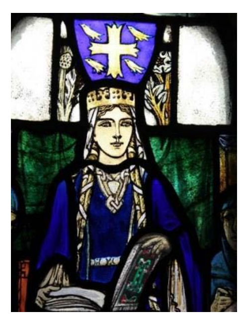
"Vladimir's Princess" - Gytha of Wessex

Princess Gytha was born in 1052, i.e. two years before the appearance (or the falling away) of the Western branch of Christianity. She is therefore considered to have been baptised Orthodox. For this reason, her marriage to Vladimir Monomakh (then Prince of Smolensk) was not only possible but was also desirable and was expected to be conducive to the strengthening of economic and cultural relations between Rus' (Russia) and England, which is exactly what followed.