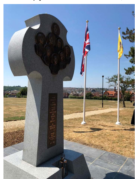
The Cross of the Romanovs Isle of White

"The yacht advanced slowly, and that which unfolded before our eyes was extremely powerful and handsome, we