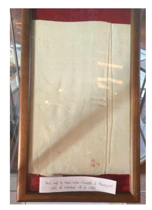
Towel of St Elizabeth Fyodorovna

turned out, their only visit to the island: the British monarchs would never see