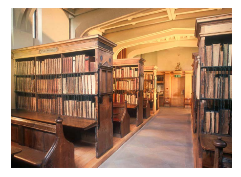
The Chained Library interior of Hereford Cathedral, Herefordshire

The spaciousness of the cathedral reminds us of God's glory. Its magnificent fourteenth-century tower was created with the generous donations