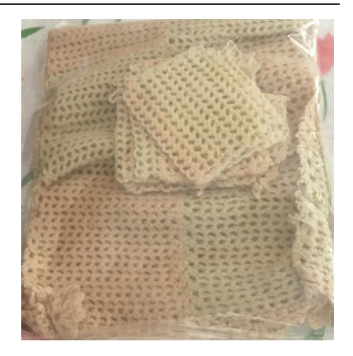
A wool rug knitted by the Grand Duchesses for the Tsarevich and found in the Ipatiev house.

Some of the personal belongings of the Romanovs and Grand Duchess Elizabeth Feodorovna put on display were from private collections. Items were sourced from all over the world. including the Historic Russian Palestinian Society, the Fund of A.K. Glazunov, the Russian Orthodox Melbourne Church Abroad in (Australia), the Martha and Mary