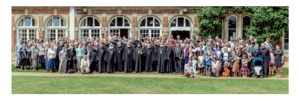
Conference participants

Martyrdom and mission – these two words can often be heard in church sermons but are usually poorly understood by modern-day Christians and are even less applicable to our everyday life. What martyrdom? We live in a free world where democracy and personal freedom are cornerstones of our society. And what is the mission of a Christion in our day and age? It often seems that these two concepts have lost their meaning and are very far from modern reality. This made it all the more interesting to visit diocesan conference, the annual "Martyrdom and Mission", and to hear talks of researchers, clergy and academics who have made an effort to investigate the topic of the theology and history of martyrdom in Orthodoxy and of the mission of martyrs.