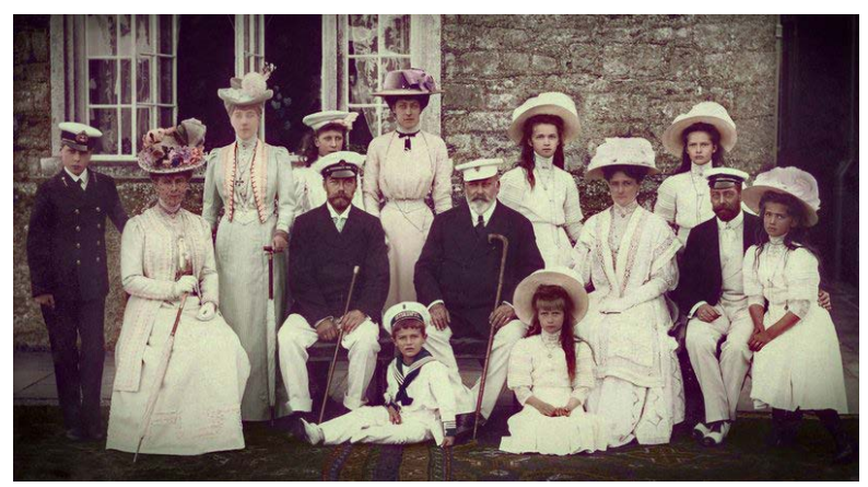
Barton Manor, 4th of August 1909

could not tear ourselves away from the tableau which was unfolding. We had before us the entire Northern squadron of the English fleet. Three lines of huge combat ships and many lines of smaller ones were arranged in parallel in the harbour of Spithead, and out towards Cowes. One hundred and fifty-three of them without counting the destroyers and the smaller ships, commanded by 28 admirals, saluting their crowned Admiral, the Emperor of Russia."