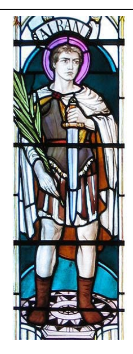
St Alban (stained window detail)

St Alban has been venerated in England and many other countries since time immemorial. Dozens of