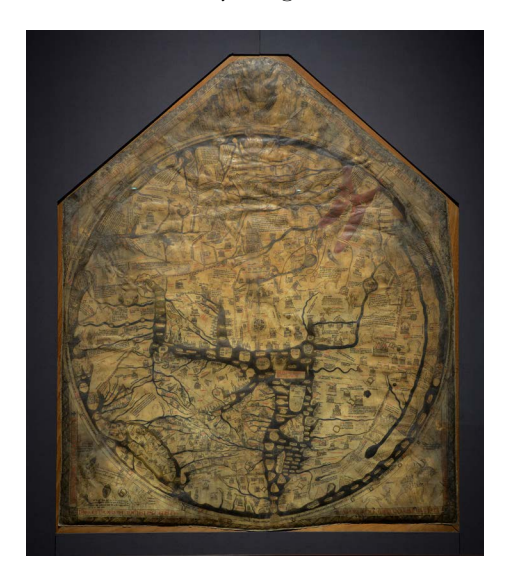
The Mappa Mundi inside Hereford Cathedral, Herefordshire

One of the greatest treasures of Hereford Cathedral is the Mappa Mundi – the largest and oldest surviving map of the world. One of the best-known early English documents,