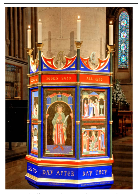
St Ethelbert's shrine-column inside Hereford Cathedral, Herefordshire

cathedral to this day. Several years ago an attractive memorial-column (often referred to as 'St Ethelbert's shrine') with twelve beautiful panels vividly relating the story of Ethelbert's life, martyrdom, veneration and miracles was installed at the entrance to the Lady Chapel. It stands on the site of his original shrine, and the place is filled with the atmosphere of holiness.