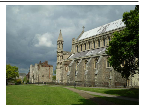
The Cathedral of St Alban in St Albans, Hertfordshire

There was a gently sloping hill nearby with flowers growing on it. Alban ascended it and in prayer asked God to send water to this hill. At once a spring gushed forth at the saint's feet and ran downhill, so the people understood that a miracle had been performed by God through Alban's prayers. The spring existed for many centuries and had healing properties. Alban was beheaded on the hill and was granted a martyr's crown in Paradise. But the swordsman who executed him never