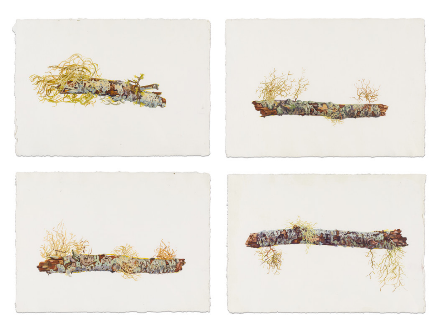
Alder Branches, Willapa Bay Gouache on handmade Khadi paper, 12"x16 ¾" each, 2016