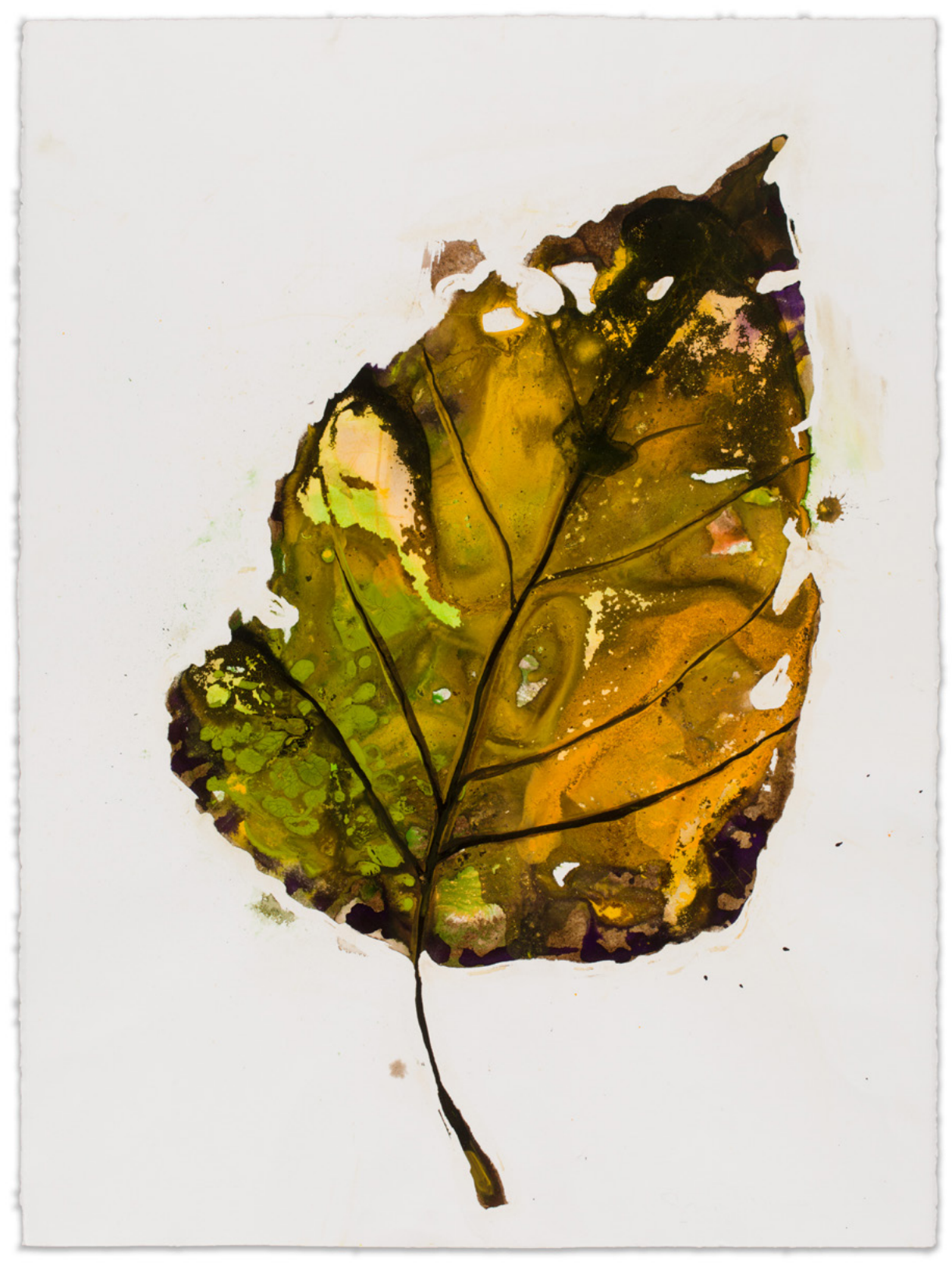
De-Composition #22 Mixed media on paper, 30"x22", 2017