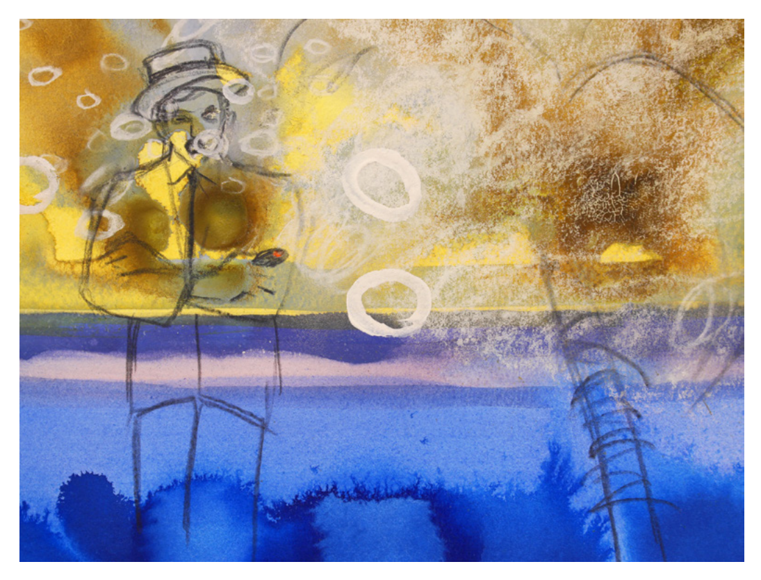
Hand-painted still from Water Stories Mixed media on paper, 11"x14", 2018