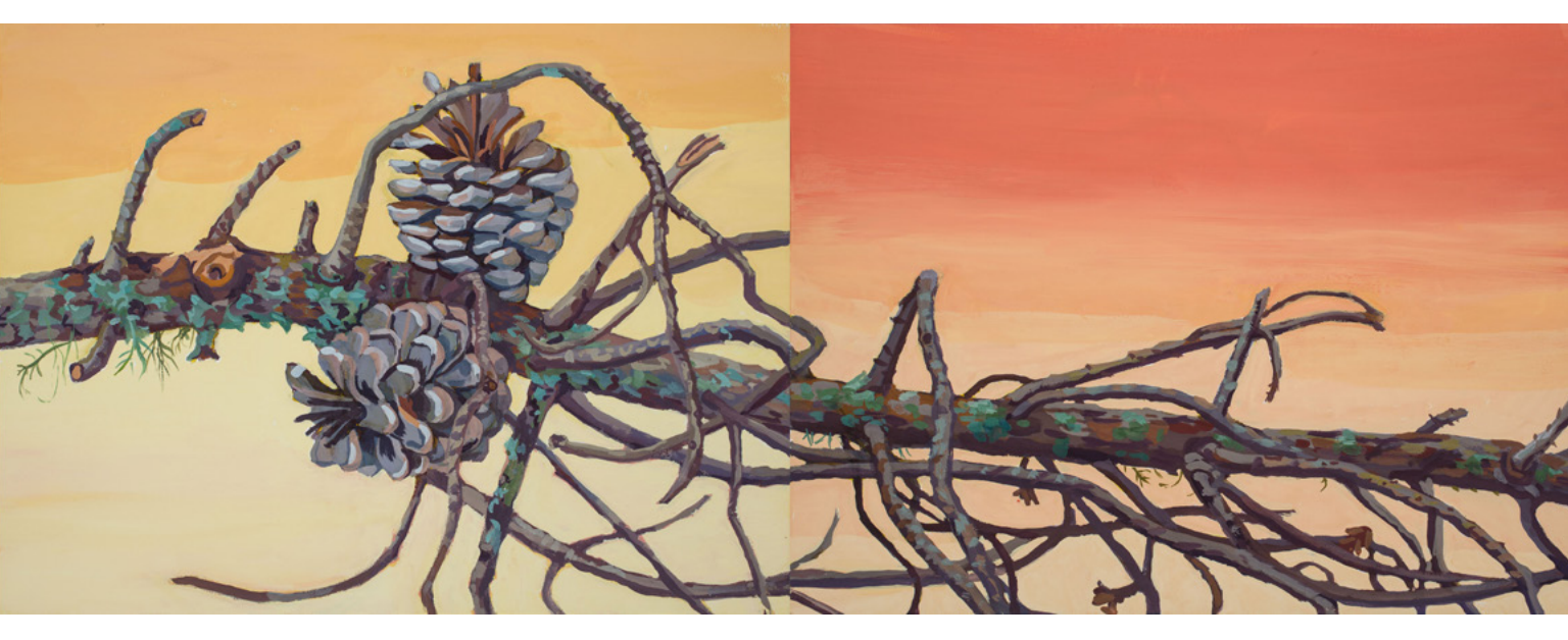
Tangled Pine Branch, Blue, Yellow & Orange Skies Gouache on four birch panels, 9"x48", 2015

Italian, natura morta ) translates back into English as "dead nature:" which is definitely what we have here. Jordon gazes steadily at the dissolution of vegetable flesh, and records the lovely colors and mottled patterns that appear in its transformation. In this show, the videos fall into two groups: some, like the leaf paintings, are brief spectacles of decay. But most tell extended stories from Jordon's past and family history. In these, Jordon's gaze doesn't waver from the awful, but she celebrates sweet and funny moments, too. Two, in particular, bookend the range from tragedy to comedy: Anita's Journey illustrates her mother-in-law's childhood experience of hiding in Nazi Germany for three years as a young child, and Cha-cha Lesson looks back fondly at the dance craze in 1960s Brooklyn. In all of the films, Rohde's music winds around Jordon's themes, and provides a wonderful counterpoint to her color play and gestural brushwork.