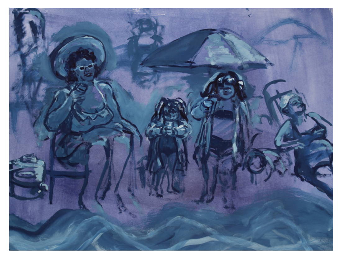
Hand-painted still from Coney Island/Far Rockaway Gouache on paper, 22"x30", 2018