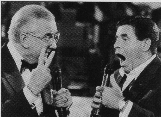
'A giant, a marvelous force': Lewis and Big Ed McMahon