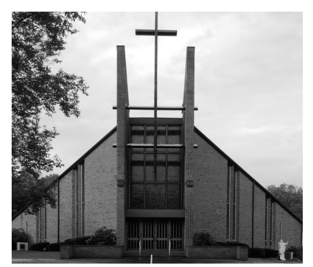
Second Sunday in Ordinary Time January 17, 2016