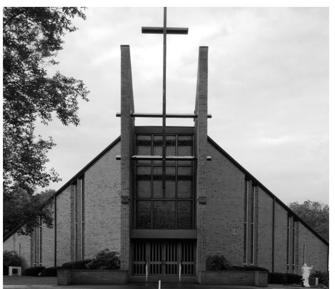
11<sup>th</sup> Sunday in Ordinary Time June 12, 2016