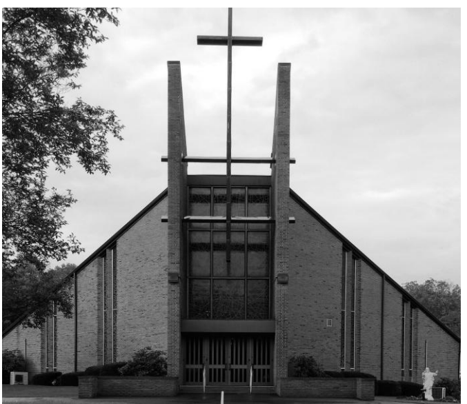
19<sup>th</sup> Sunday in Ordinary Time August 7, 2016