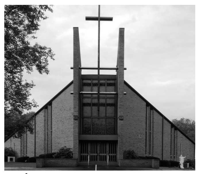
29<sup>th</sup> Sunday in Ordinary Time October 16, 2016