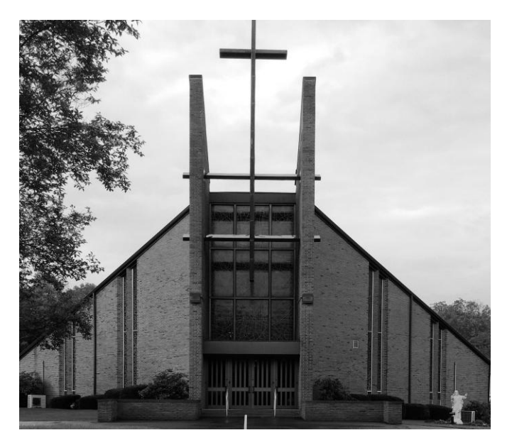
Eighth Sunday in Ordinary Time February 26, 2017