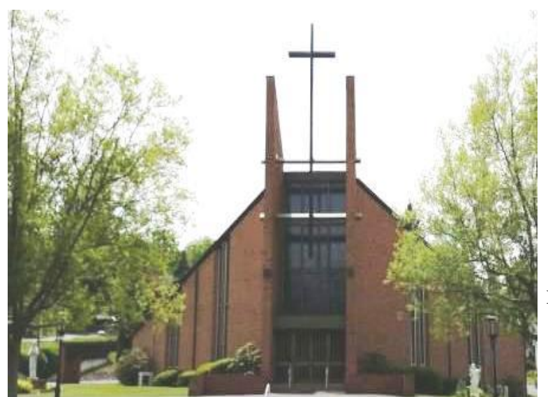
The 20<sup>th</sup> Sunday in Ordinary Time August 20, 2017