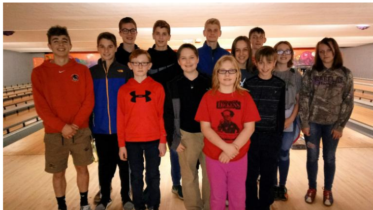
Youth group bowling participants.