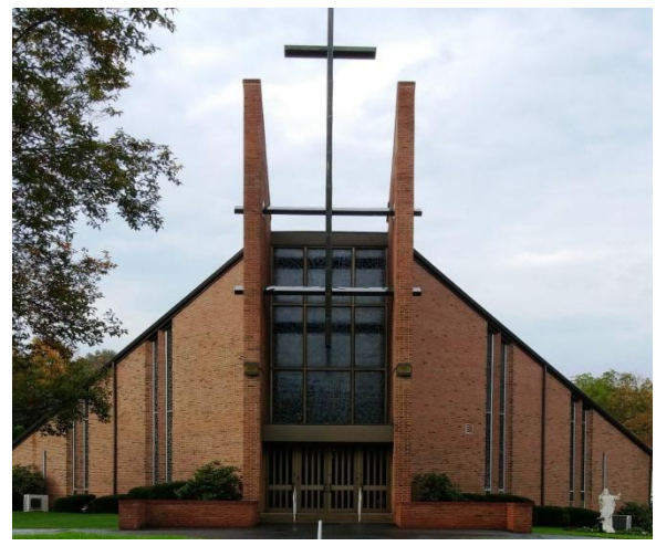
13<sup>th</sup> Sunday in Ordinary Time July 1, 2018