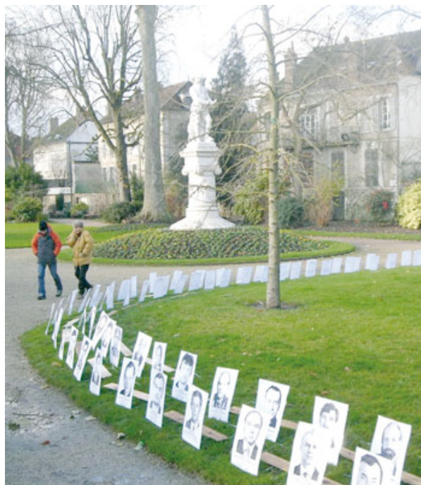
Photographs of Chernobyl liquidators displayed in tribute.