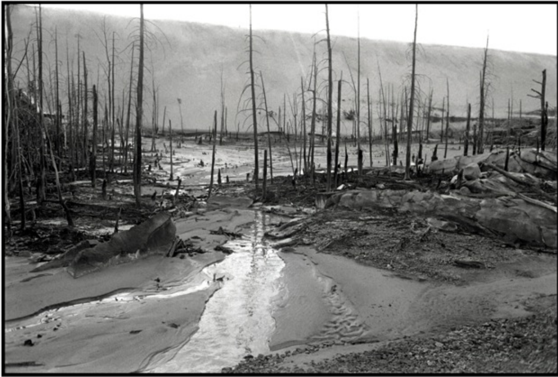
Stanrock Mill Tailings Area, Elliot Lake, Ontario, 1986. The 30-foot high wall of white sand behind the trees is made up of uranium tailings. Over 130 million tons of these tailings have been deposited in the Elliot Lake region and have contaminated the entire 58-mile long Serpent River system, finding their way into Lake Huron.