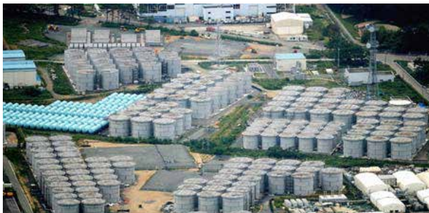
A portion of the "tank farm" at Fukushima Daiichi

The Fukushima catastrophe has resulted in the release of radioactive fallout into the atmosphere and the discharge of radioactive liquid effluent into the Pacific Ocean. Radionuclides released include cesium 134, cesium 137, strontium 90, plutonium 239, iodine 131 and tritium.