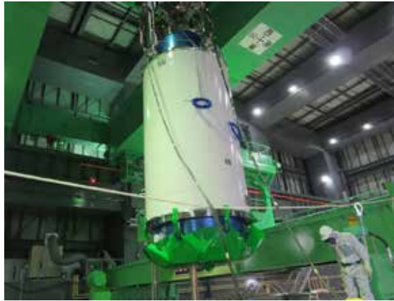
Official TEPCO photo at left shows the beginning of irradiated nuclear fuel removal at Unit 4.

What took so long? First, steel braces were built to bolster the pool floor, so it wouldn't simply drop out. Then, an exoskeleton had to be built, to stabilize the reactor building, so it could support the necessary crane. A new roof had to be added as well. Finally, in November 2013, fuel removal began. That job took a year to complete.