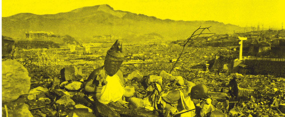
The atom bomb that destroyed Nagasaki (pictured above, shortly after the blast and fire) used reprocessed plutonium. It killed 40,000 people right away and an additional 100,000 within five years — from radiological and physical injuries.

“During my eight years in the White House, every nuclear weapons issue we dealt with was connected to a nuclear reactor program.” — Al Gore