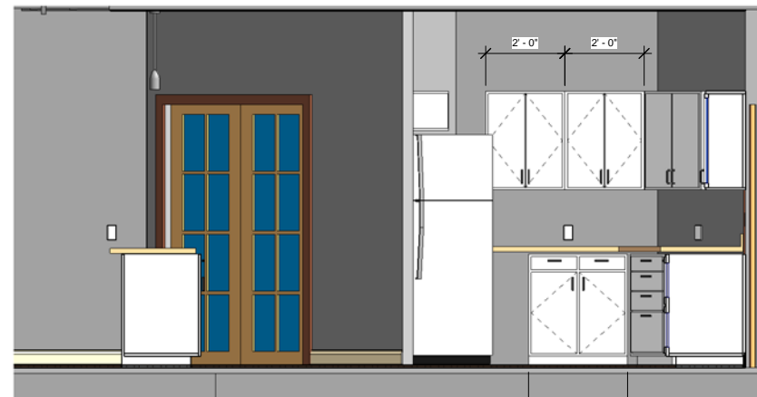
④ KITCHEN ELEVATION - C 1/2" = 1'-0"