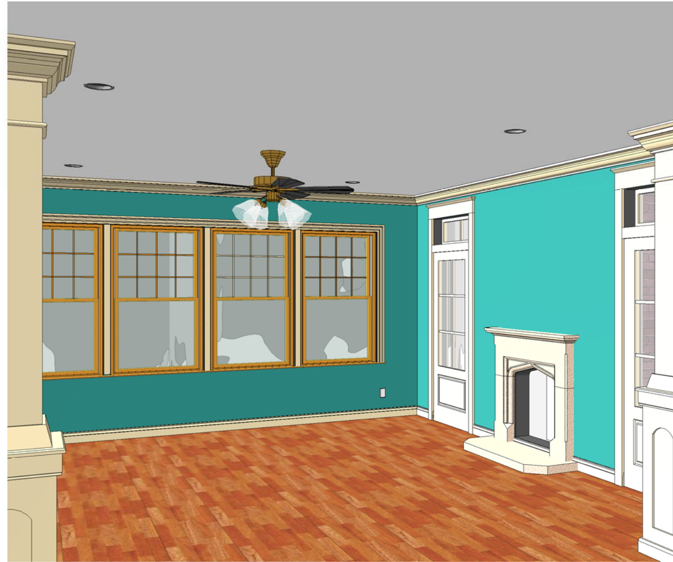
① INTERIOR PERSPECTIVE - GREAT ROOM

NOTE: GO TO INTELLIGENTHOUSEPLANS.COM TO REQUEST ADDITIONAL INTERIOR PERSPECTIVE VIEWS