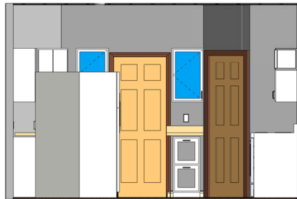
⑤ KITCHEN ELEVATION - D 1/2" = 1'-0"