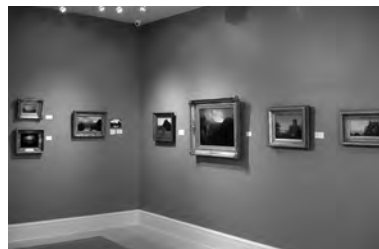
Installation in the Catharine Beecher Gallery