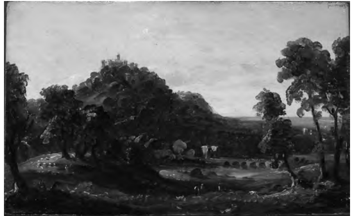
Thomas Cole, Sketch for Departure , 1837. oil on panel. Private collection

The 2008 exhibition at Cedar Grove addressed the subject of Thomas Cole's "oil sketches", a relatively unknown aspect of Cole's artistic output and process. The show included twenty-one artworks by Cole, and eleven paintings by several of his followers, including Frederic Church, Albert Bierstadt, and Sanford Gifford. Also on display were evocative instruments of Cole's craft including his paint brushes, traveling sketch box, and palettes still covered with paint.