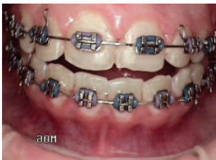
SeLECT DEFENSE surface sealant. Same patient 90 days after restorations and addition of SeLECT DEFENSE. Note the absence of inflammation.