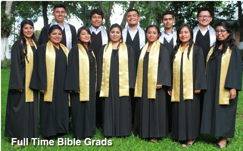
Full Time Bible Grads