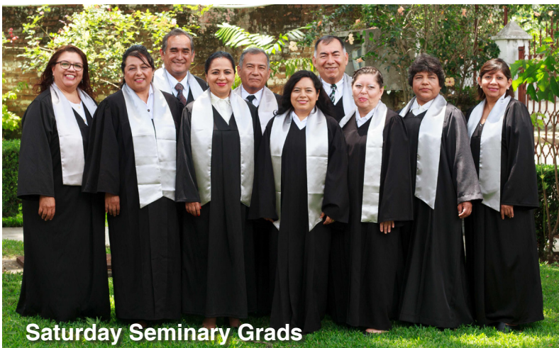
Saturday Seminary Grads