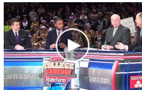
ESPN's College GameDay live taping at Vanderbilt Memorial Gym Feb. 11, 2012