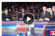
ESPN's College GameDay live taping at... Feb 11, 2012