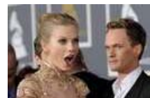
2012 Grammys Red Carpet