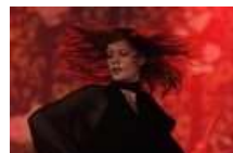
Bonnaroo Over the Years