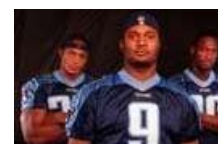
Titans' best & worst draft picks