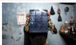
Case of 'Untreatable' TB Echoes Globally