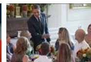
Four Groups Are Key to an Obama Victory 05:01