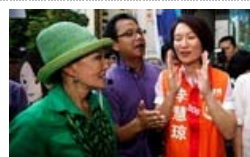
Friction Fuels Vote Turnout in Hong Kong