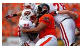
How to Save the Big Ten