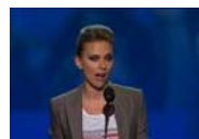
Actress Scarlett Johansson Speaks to Young Americans, Enc... 00:44

QUAN Stock to Watch NDA Signed, Researcher Nears Major Breakthrough - Buy Now!