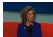
Schultz: If Ryan Wants Medicare for His Grandkids, He'd... 00:50