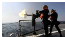
Geography Strikes Back