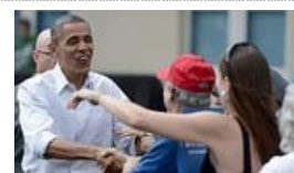
Obama Vows to Fight 'Privatizations'