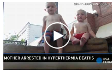
Police: Mom was having sex while kids died in hot car