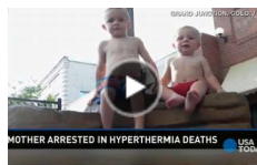
Police: Mom was having sex while kids died in Jan 17, 2013