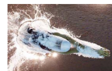
Top 10 photos of the year