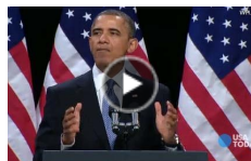
Obama: We have the resolve to put Jan 29, 2013