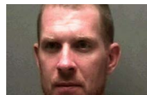
Rutherford County Most Wanted