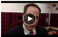
Blackman boys go undefeated