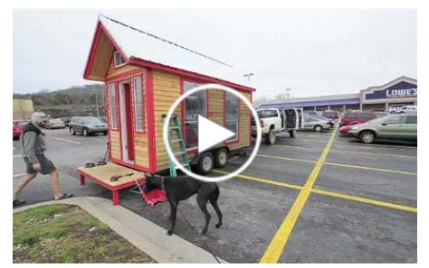
Tennessee Tiny Homes constructs 100-square-foot homes

Congregants are rattled by the repeated vandalism, she said.