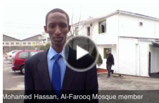
Mosque Vandalized in Nashville Feb 11, 2013