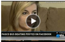
School bus fight captured on video, recorder susp... Feb 7, 2013