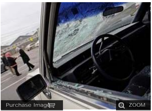
An Al-Farook mosque funeral car had smashed windows and other damage.