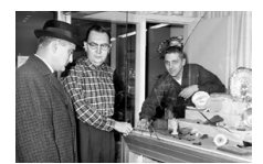
Nashville Then: January 1963