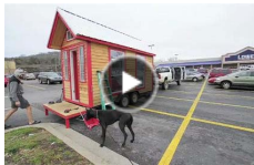
Tennessee Tiny Homes constructs 100-square-f... Feb 11, 2013