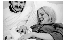
Nashville Then: January 1973