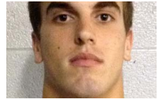
2013 UT football signing class