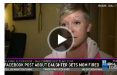
Facebook post about daughter gets mom fired Feb 7, 2013