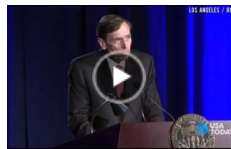
David Petraeus apologizes for affair