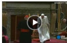
Pope Francis stumbles on stairs