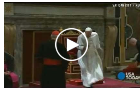
Pope Francis stumbles on stairs