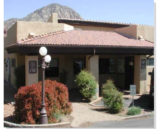
South side of building