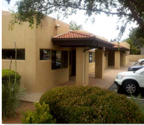
View of Building

This property is also in very close proximity to the Sedona Medical Center, the Sedona Public Library and is immediately adjacent to some great eateries.