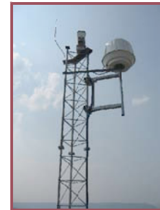
View of completed tower from rooftop. Antenna mount, microwave antenna remote ENG camera, all cabling & lightning suppression configured & installed by DSI.