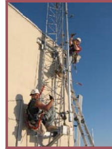
Installation of second & third tower section

The overall job requires care because the site is located on an apartment building occupied by private residents.