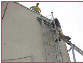
Tower Mount & Section Install